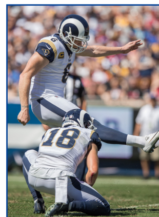
P Johnny Hekker

Hekker joins Cardinals K Phil Dawson as the only active players with at least one made field goal and a touchdown pass.