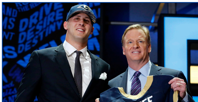
Rams QB Jared Goff and NFL Commissioner Roger Goodell during 2016 NFL Draft