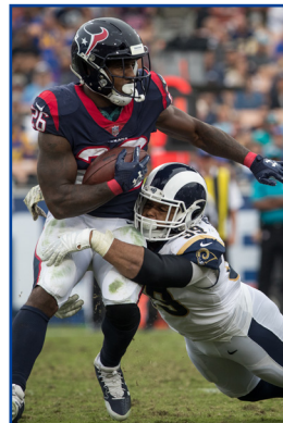
DT Aaron Donald

Donald recorded a league-best 20 tackles for loss during the 2019 season. The Pitt product finished first in the NFL with 25 tackles for loss during the 2018 regular season. Donald posted 15 TFL in 14 games during the 2017 season. The 15 TFL was tied for the ninth-most last season and the most by an interior defensive lineman. Donald recorded a then career-high 22 tackles for loss in his second season in the NFL in 2015.