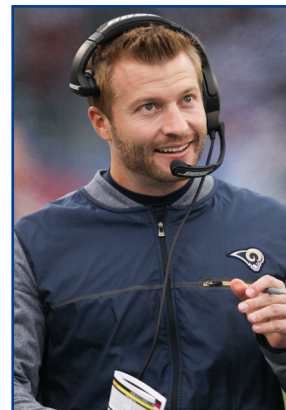
HC Sean McVay

Rams Head Coach Sean McVay took over a team that was coming off of a 4-12 season and ranked 32nd in scoring, helped transform it into the No. 1 scoring team in the league and helped secure the franchise's first NFC West title since 2003.