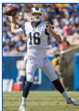
QB Jared Goff

QB Jared Goff has found his favorite redzone target in WR Cooper Kupp. The duo has combined for 21 touchdown strikes in only 39 games played together.