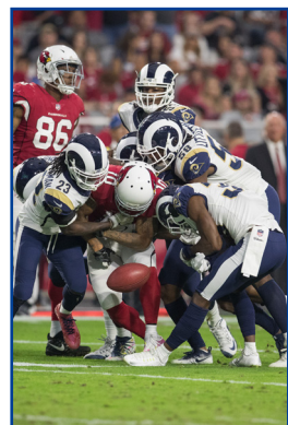
Rams defenders forcing a fumble

The Los Angeles Rams forced two fumbles against the Carolina Panthers in the 2019 season opener and finished tied for 13th in the NFL in forced fumbles (13) this season, continuing a trend by Rams defenses.