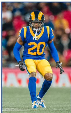
CB Jalen Ramsey

The Rams have taken the ball from their opponents 82 times since the start of the 2017 season and scored 314 points off takeaways since McVay became the head coach, the most in the league since the start of the 2017 season. Last season, L.A. took the ball away from their opponents 30 times, the third-most in the NFL. L.A. scored a league-best 113 points off takeaways during the 2018 regular season.