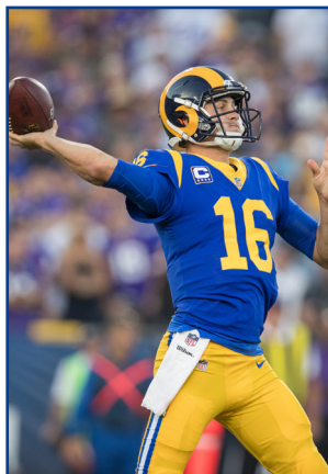
QB Jared Goff

Rams QB Jared Goff has been amongst the best passers in the league since McVay took over in 2017. The Cal product is one of three QBs to throw for over 13,000 yards since the start of the 2017 season. Goff's 13,130 yards are the third-most in the NFL during that time frame.