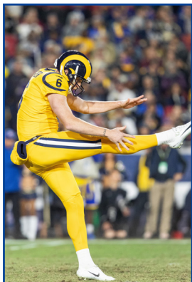
P Johnny Hekker

The Oregon State product established a career-long 75-yard punt in the team's 2016 Week 9 contest against the Carolina Panthers, a record that stuck for a week before he booted a 78-yarder against the New York Jets in the Rams' Week 10 contest. On the season, Hekker had three punts over 75 yards.