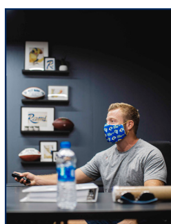
Rams Head Coach Sean McVay

Thousand Oaks, Calif. - The 2020 Los Angeles Rams Training Camp Presented by UNIFY Financial Credit Union will take place for the first time at the team practice facility located on the campus of Cal Lutheran University in Thousand Oaks, Calif.