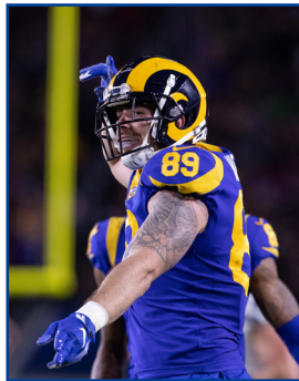
TE Tyler Higbee

Higbee also set a single-season franchise record for receptions by a tight end with 69, passing Pete Holohan's 1988 total of 59 receptions.