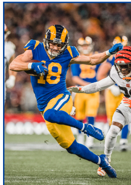
WR Cooper Kupp

Since McVay took over before the 2017 season, the Rams offense has been amongst the most productive in the league. L.A. averages 398.0 scrimmage yards per game under the guidance of McVay. The Rams are one of only three teams to average at least 395 scrimmage yards over the last 48 regular season games.