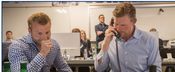
Rams Head Coach Sean McVay and General Manager Les Snead

The 2018 NFL Draft marks the 82nd draft for the Rams franchise dating back to the second-ever NFL draft in 1937. The team has not had a first-round selection in only eight of those drafts, most recently in 2017.