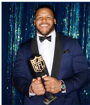
DT Aaron Donald