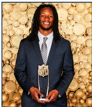
RB Todd Gurley