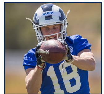
Rams WR Cooper Kupp at the 2017 Rookie Minicamp. Kupp led the Rams in receiving yards and earned PFWA All-Rookie honors.

The first six players selected in the Rams 2017 draft class all started at least one game and the eight-man draft class collectively, combined for 26 starts with S John Johnson III leading the pack with 11 starts as a rookie.